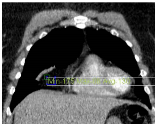
Figure 3. Coronal enhanced thorax CT revealed that atelectasis due to increased right cardiophrenic fatty tissue (- 130 HU).